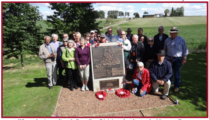
Where the Australian & Canadian Divisions fought to take Mouquet Farm. Here the Germans had their advance Headquarters on their Second Line