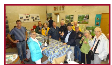
Calvados at Le Grand Fumichon