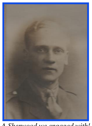
A Sherwood we engaged with!