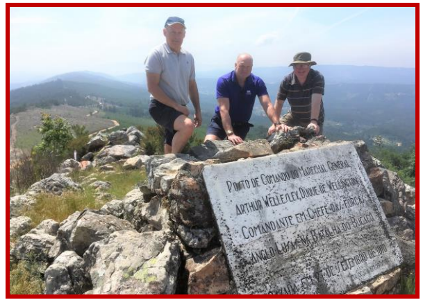
Wellington's Headquarters Bussaco Ridge with the 18 Kilometre battlefront beyond