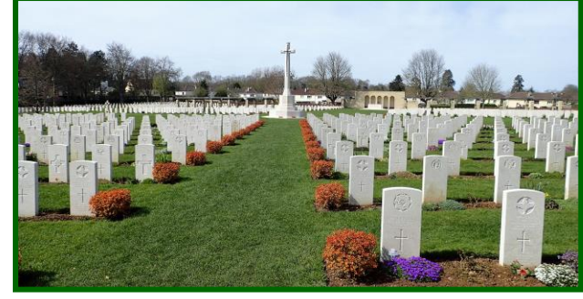
Ranville CWGC Cemetery