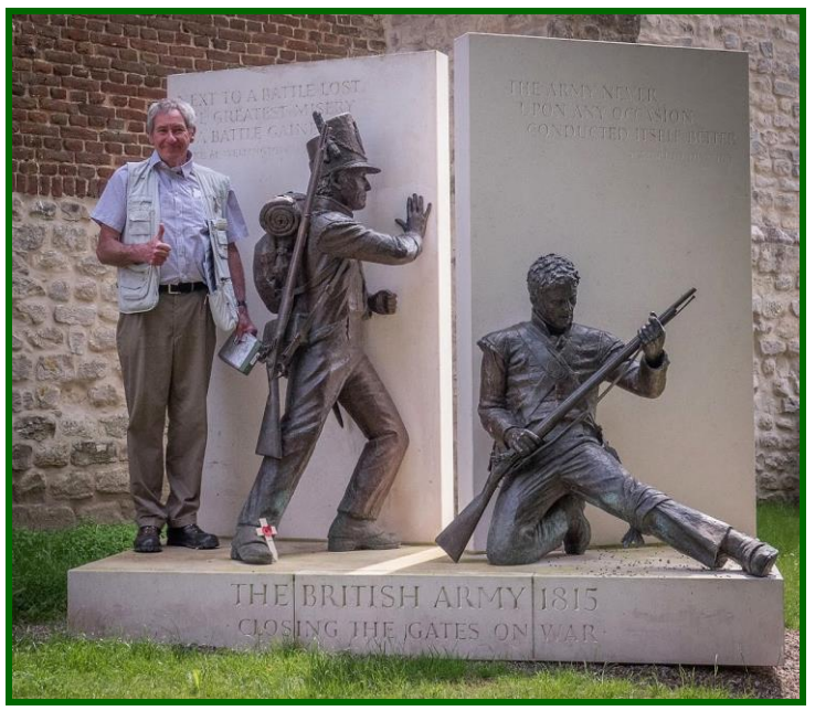
The Memorial to the British Army that fought at Waterloo