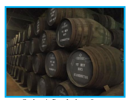
Graham's\ Port\ Lodge\ -\ Oporto