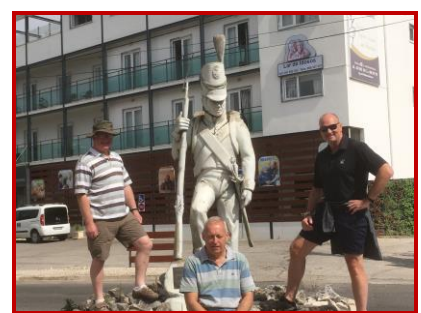
Vimeiro – Where 'Line beat Column'