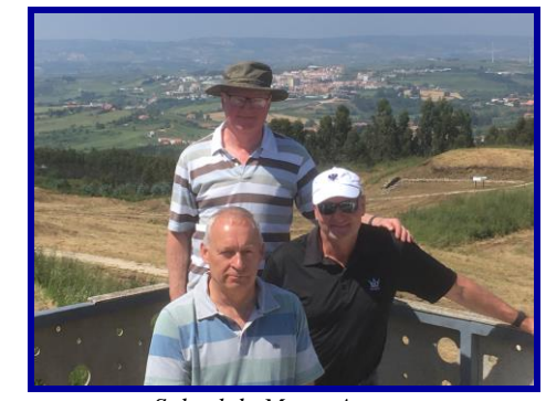
Sobral de Monte Agraço