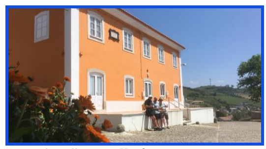
Outside Wellington's Headquarters at Pero Negro