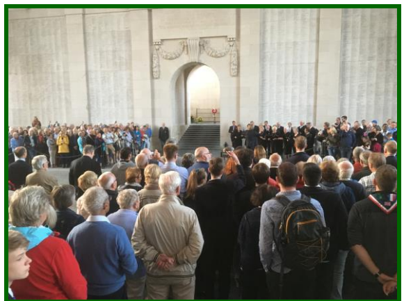
Menin Gate Ceremony