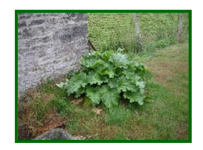
VC among the rhubarb!