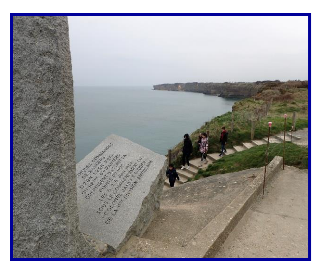
Pont du Hoc

They walked the cliffs at Arromanches Arromanches and visualised the logistics that enabled this massive seaborne assault landing, the German heavy guns at Longues and the scene of the US Ranger's dramatic attack on Ponte du Hoc. Whilst in Normandy they visit Bayeux's Commonwealth War Graves Commission Cemetery, the famous Bayeux Tapestry, Cathedral and a Calvados winery.